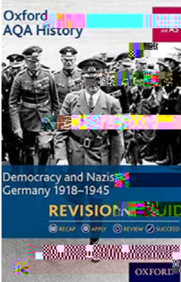
Oxford AQA History for A Level: Democracy and Nazism: Germany 1918-1945